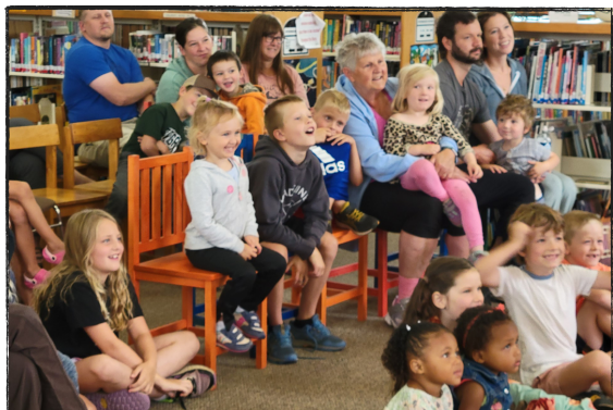
Any age can have fun at the library!

Looking for volunteers to help staff the Used Book Room. Please fill out the volunteer form available in the Used Book Room and someone will get back to you!