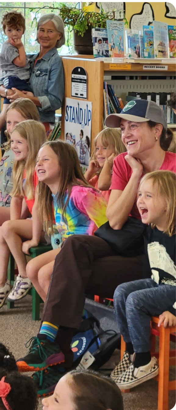
Families having fun at the library!

*Please check the library's website for the movie: https://weisscommunitylibrary.com